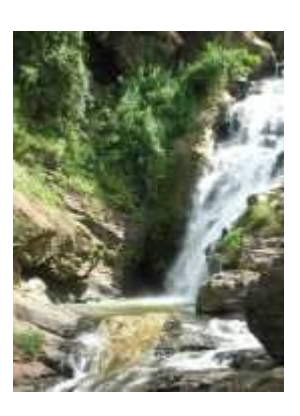
Diyaluma Waterfall Diyaluma means watery light. To reach the breathtaking beauty of Dunhinda falls (210 feet) you will have to travel about 5 Km from Badulla along the Mahiyangana road, and walk for another 2 Km (trekking) away from the main road