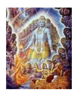
The story is part of the famous Indian epic Ramayana.

The Sita or Rawana Ella Cave is located about 2 km outside of Ella. A small cave, connecting to other, deeper ones. According to local legend it that it was used by the Demon King Rawana to hide the Princess Sita, after abducting her in India.